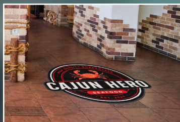
ColorStar Impressions® HD Custom Shape